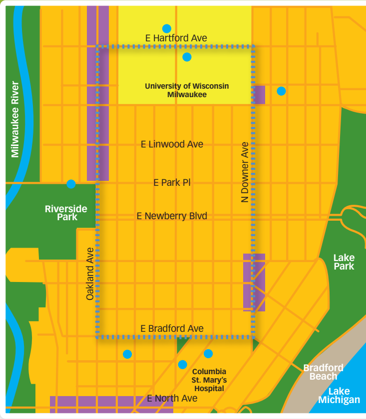
● Schools & Childcare ■ Commercial & Entertainment Districts